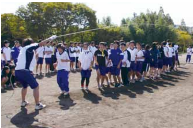
▲ Sports Day