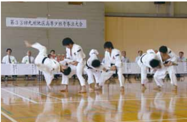
▲ Shorinji-kempo Club