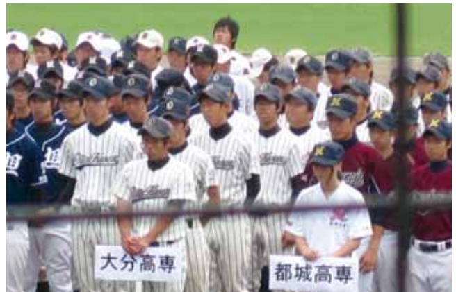
▲ Baseball Club