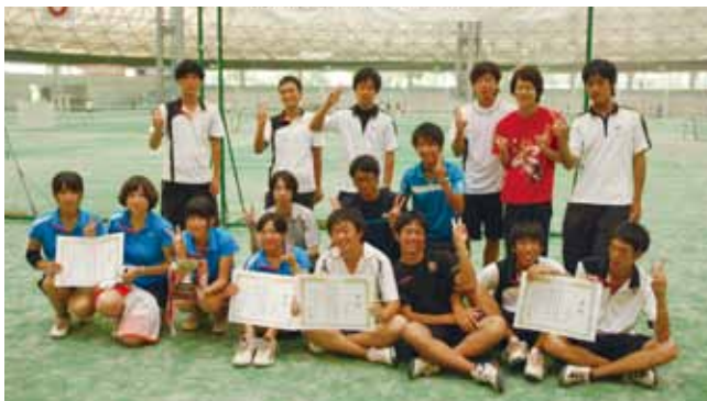
▲ Tennis Club