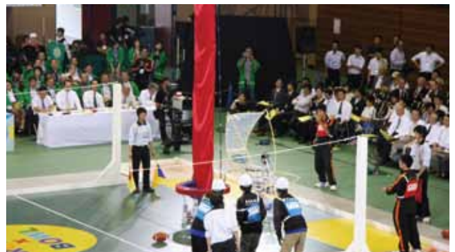
▲ Robot Research Club