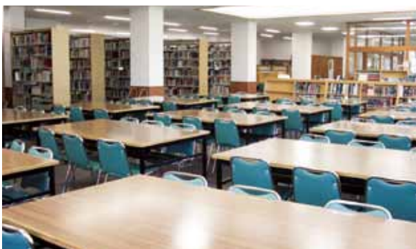
◀ Reading Room