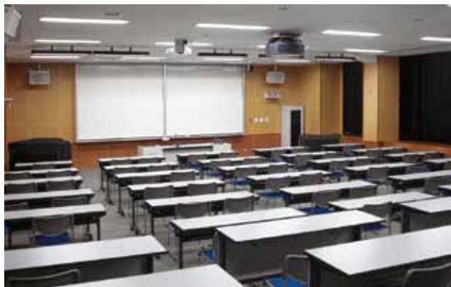
▲ Comprehensive Media Room