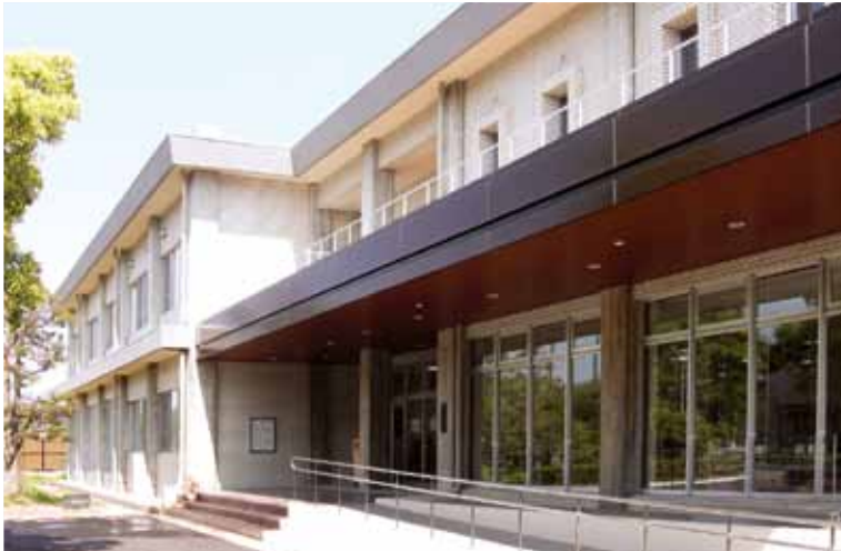
▲ Library Building