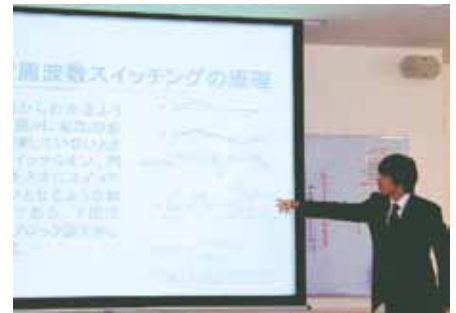
▲ Presentation of Graduate Research Project