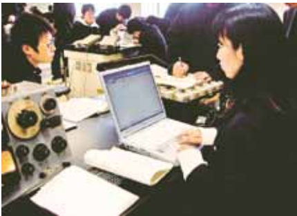
▲ Engineering Experiments

Our department's purpose is to produce the engineers who can be active in a wide range of the fields, such as electricity, electronics, and information - communication technology, while mastering not only the knowledge of electrical and electronic engineering, but also the ability to flexibly adapt to an computer and information - communication fields. Our department helps our students think scientifically, design skillfully and practice cooperatively. The Students are trained to have essential knowledge and creative engineering skills in the fields of electrical energy, electronics, information - communication technology, control systems, computer science, and related technologies.